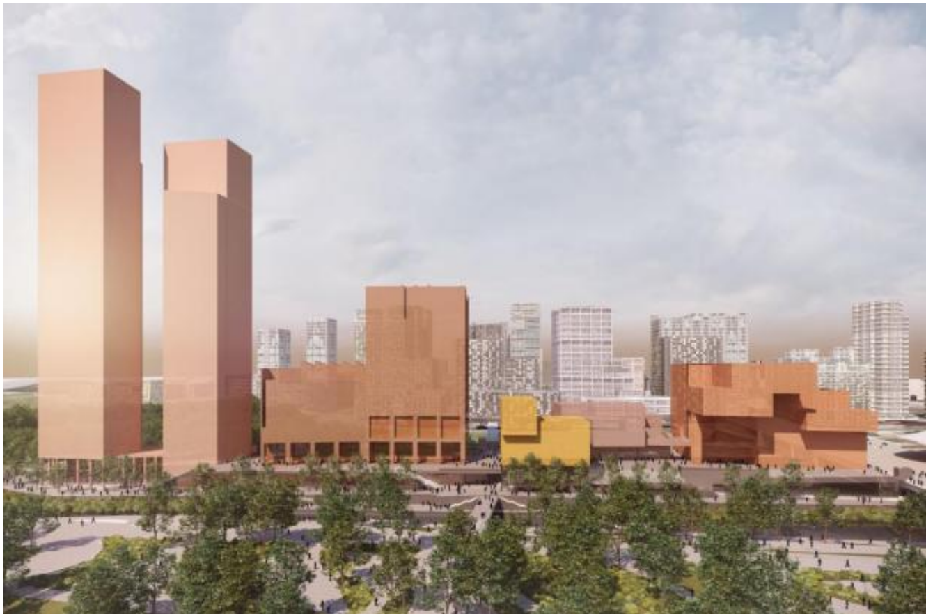
Building blocks: the Stratford Waterfront plan